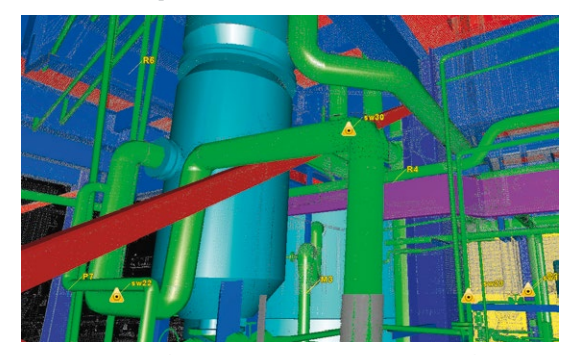
The automated Pipe Run feature lets users select points on connected, straight pipe sections, and the system automatically models a best fit pipe run with elbows in seconds.